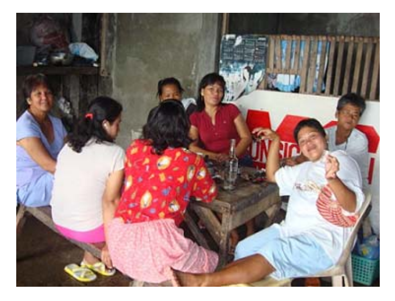
Figure 5: Magririgaton kill time between auctions by drinking local wine called lambanog .