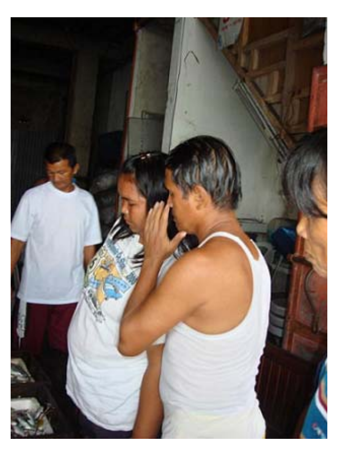
Figure 4: A magririgaton whispers his bid.

Bulungan started when magririgaton in town could no longer handle large volumes of fish landings. This was in the 1980s when fish landings, both by small-scale fishermen and fishermen on big commercial fishing vessels, were huge. Large volumes of fish meant bigger capital and a much more systematic way of managing sales. Most, if not all, magririgaton did not have the wherewithal for this. This compelled fishermen to bring their excess catch to neighboring towns which had kumisyunan. Enterprising individuals from the town who saw an opportunity started putting up kumisyunan to fill this economic gap (Turgo, 2010). The establishment of fish kumisyunan also attracted other fishermen from other fishing communities and neighboring towns. During my fieldwork, there were four kumisyunan in town. Trading hours varied from one kumisyunan to another, although in general, during busy months (when fish landings averaged six per day), they usually opened at 7 a.m. and closed at around midnight to accommodate fishermen from far-flung communities and towns. The rest of the year, due to the prevailing monsoon season called amihan