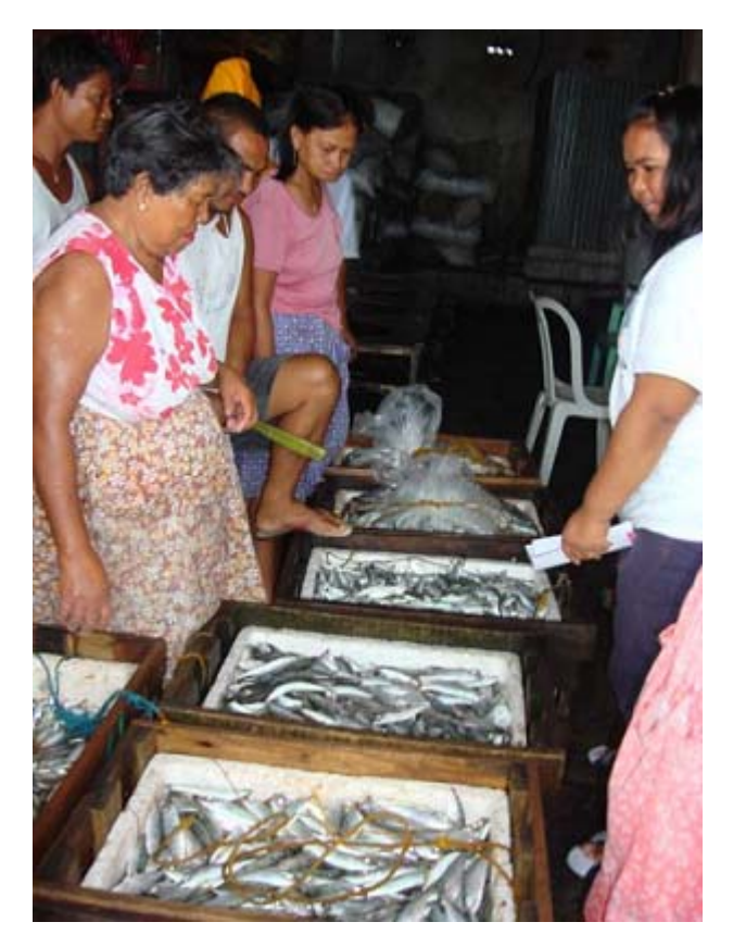
Figure 3: Boxes of fish are examined by magririgaton before the auction begins.

Most of the kumisyunan studied had a capital of at least PHP 500,000. A daily turn-over is hard to calculate because of the variation in fish landing, although from May until August, the busiest months of the year, one fish trading house estimated that in a day they spent as much as PHP 70,000 to pay for fish brought in by fishermen. In lean months, from September until March, when bad weather prevented fishing boats from venturing out, PHP 10,000 would be the average transaction per day. In these lean months, fish trading houses would frequently "import" from a fish port in Lucena and sell the fish in fixed prices to magririgaton. In these lean months, owners of kumisyunan told me that they were only getting by, earning just enough to pay for their utility bills, rent (two of the kumisyunan were just leasing their space), workers (the magpapabulong receives a regular monthly salary of PHP 7,000 and a certain percentage of the total income after expenses per month), and local and national taxes. It should also be mentioned that the income of kumisyunan varied and some earned more than others.