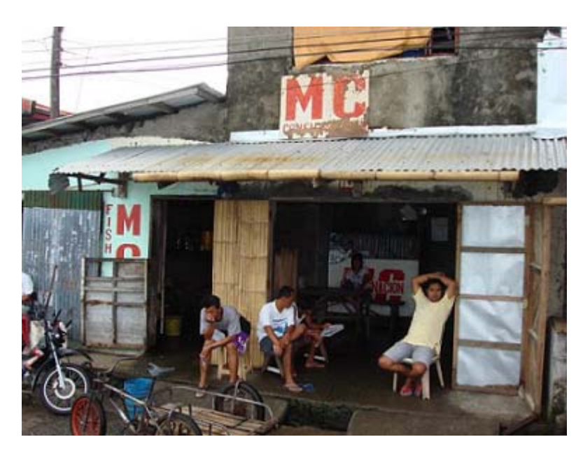
Figure 2. The facade of one of the four kumisyunan observed in this study. Five magririgaton wait for boats to land.

I grew up in a place not far from this fishing community and the fish trading houses, and my father was a fisherman. Tagalog is universally spoken in the area and it is my first language. In a number of ways then, my study falls under the rubric of insider research (see, for example, Turgo 2012a, 2012b). The fishing community where many if not all magririgaton in kumisyunan came from is reached some six hours by bus from Manila; it is in one of Quezon province's numerous coastal towns dotting the long coastline of Lamon Bay. There were 708 inhabitants in the community at the time of fieldwork. Fishing had become economically unproductive for small-scale fishermen in the community beginning in 2000. Several reasons could be cited but the most obvious ones were the weak local regulatory regime on illegal fishing, overfishing, the high cost of fishing implements and petroleum, and the continued operation of big commercial fishing boats in areas designated as municipal waters (Campos, 2003; Turgo, 2010). When I say small-scale fishermen, I refer to fishermen using small craft and simple gear (though not necessarily simple techniques) of relatively low capital intensity. Their fishing operations are skillintensive and they fish in relatively near-shore waters in single day or night operations (Turgo, 2010, p. 1).