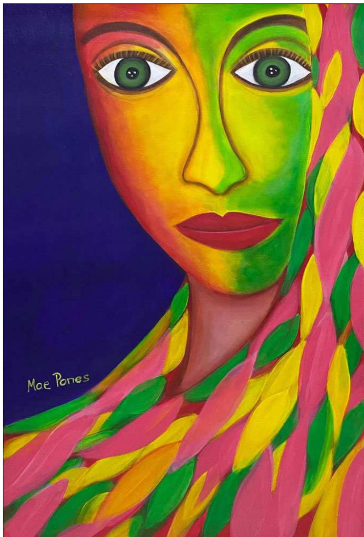
Mulat (Colours of a Woman)