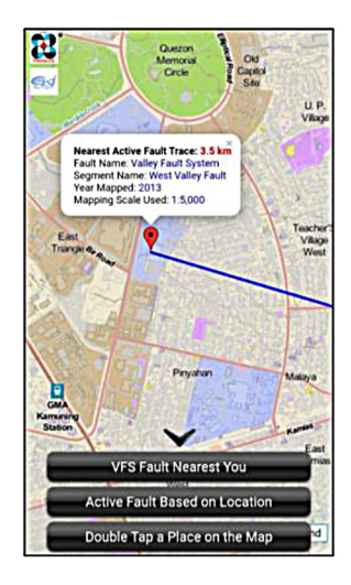
Figure 1 Location of the East Avenue Medical Center 3.5 Kilometers from the West Valley Fault (from FaultFinder Version 9.0)

One of the key issues in addressing long-term challenges in anticipating a major earthquake in Metro Manila pertains to governance. Disaster response, which includes direct aid to earthquake victims, infrastructure reconstruction, relocation of victims displaced by the earthquake, healthcare response, and education, is mainly channeled through government bodies. Issues in governance and coordination of local disaster response and preparedness could potentially drain bureaucratic resources. Given the confusing situation on the ground in the immediate aftermath of a major earthquake, local bureaucrats may be overwhelmed by the task of delivering needed healthcare response. There is need for more studies that could help inform policy and disaster management decisions, including data on epidemiology of injuries resulting from major earthquakes and how these findings feed into disaster risk.