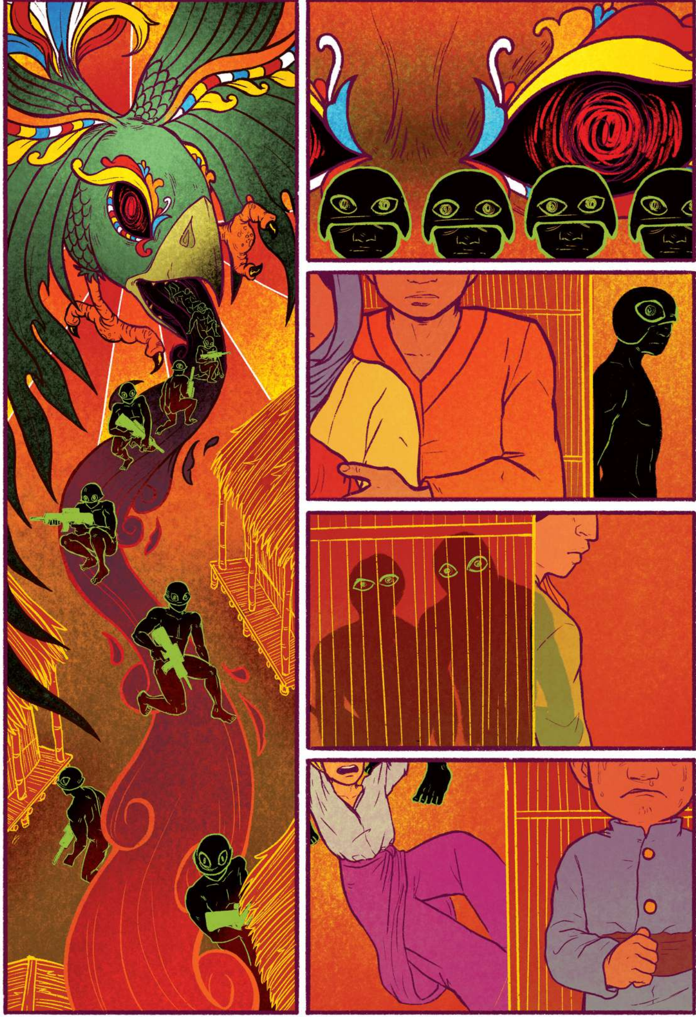
VOLUME 21 ISSUE 1 (2019)