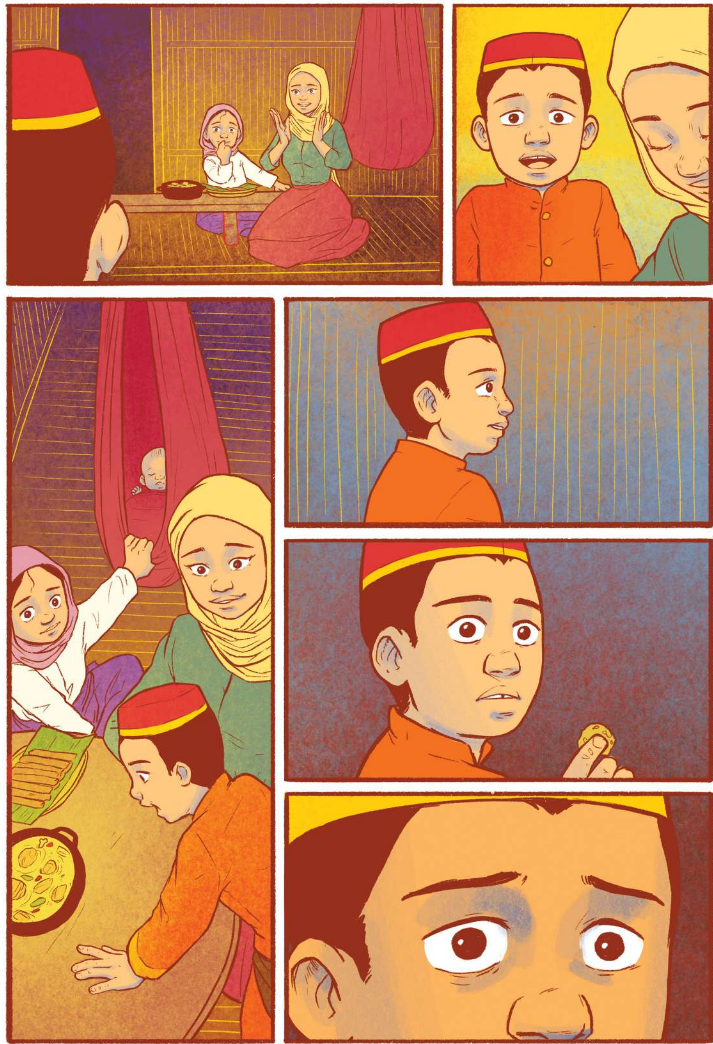
VOLUME 21 ISSUE 1 (2019)