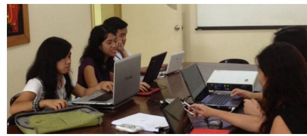
Research team working on a project funded by the UP Diliman Office of the Vice-Chancellor for Research and Development.

Attuned with the age of the information economy, MUHON is the UP College of Architecture's vehicle for completing the knowledge value chain in the designed environment field. Bodies of knowledge generated through research and professional practice go through the cyclical and iterative process involving value adding activities that lead to innovation.