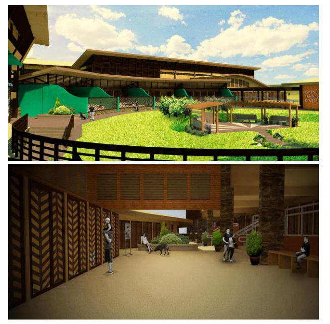
Figures 9 and 10. Perspectives of Adoption Building. (Image rendered by author)