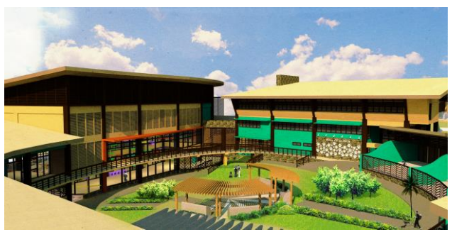
Figure 5. Aerial perspective of Exercise and Recreation Park. (Image rendered by author)