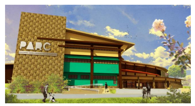
Figure 1. Rendered image of proposed Main Building façade. (Image rendered by author)

Key Words: Animal, Rehabilitation, PARC, PAWS, Animal shelter