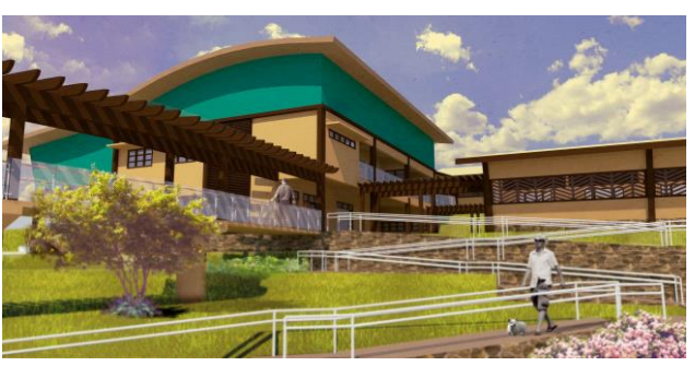
Figure 8. Perspective of Support and Quarantine Buildings.