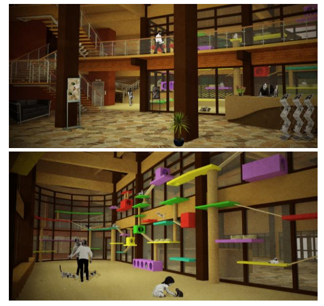
Figures 3 and 4. Interior perspectives of Main Lobby and Cattery. (Images rendered by author)

Figure 2. Proposed Site Development Plan of PARC (Image rendered by author)