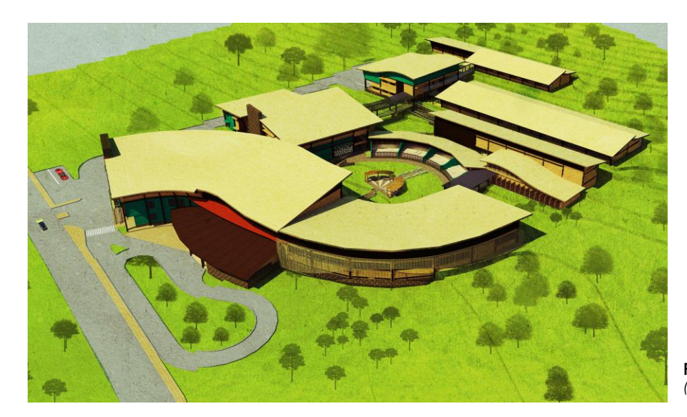
Figure 11. Aerial site perspective. (Image rendered by author)