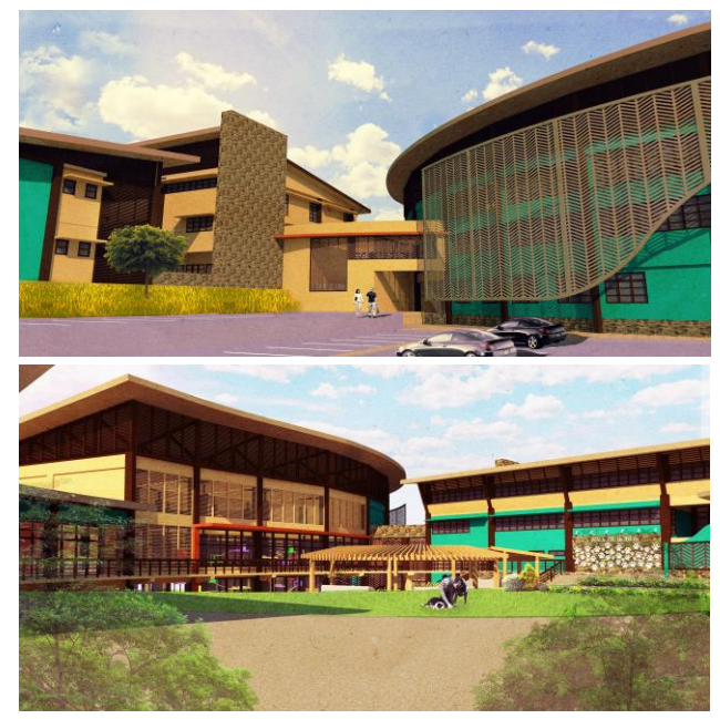
Figures 6 and 7. Views of Veterinary Hospital from parking area (above) and outdoor park (below). (Image rendered by author)