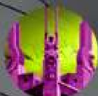
History, Theory, and Criticism