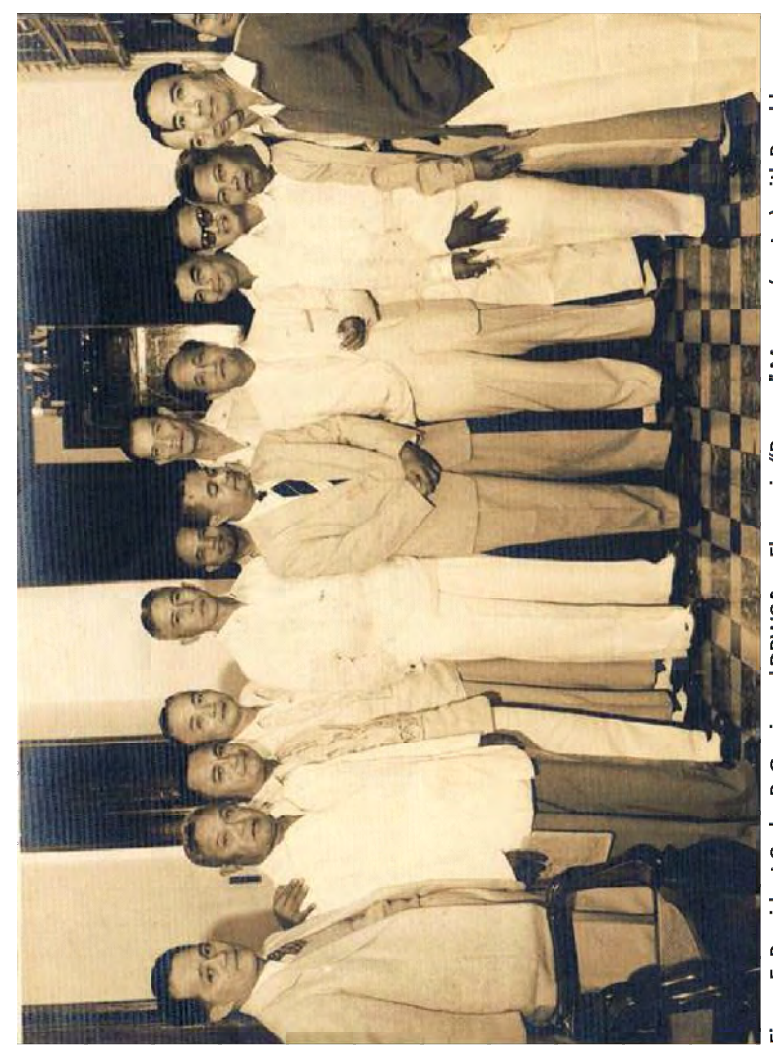
Figure 5. President Carlos P. Garcia and DPWC Sec. Florencio "Pensoy" Moreno (center) with Romblomanon leaders.