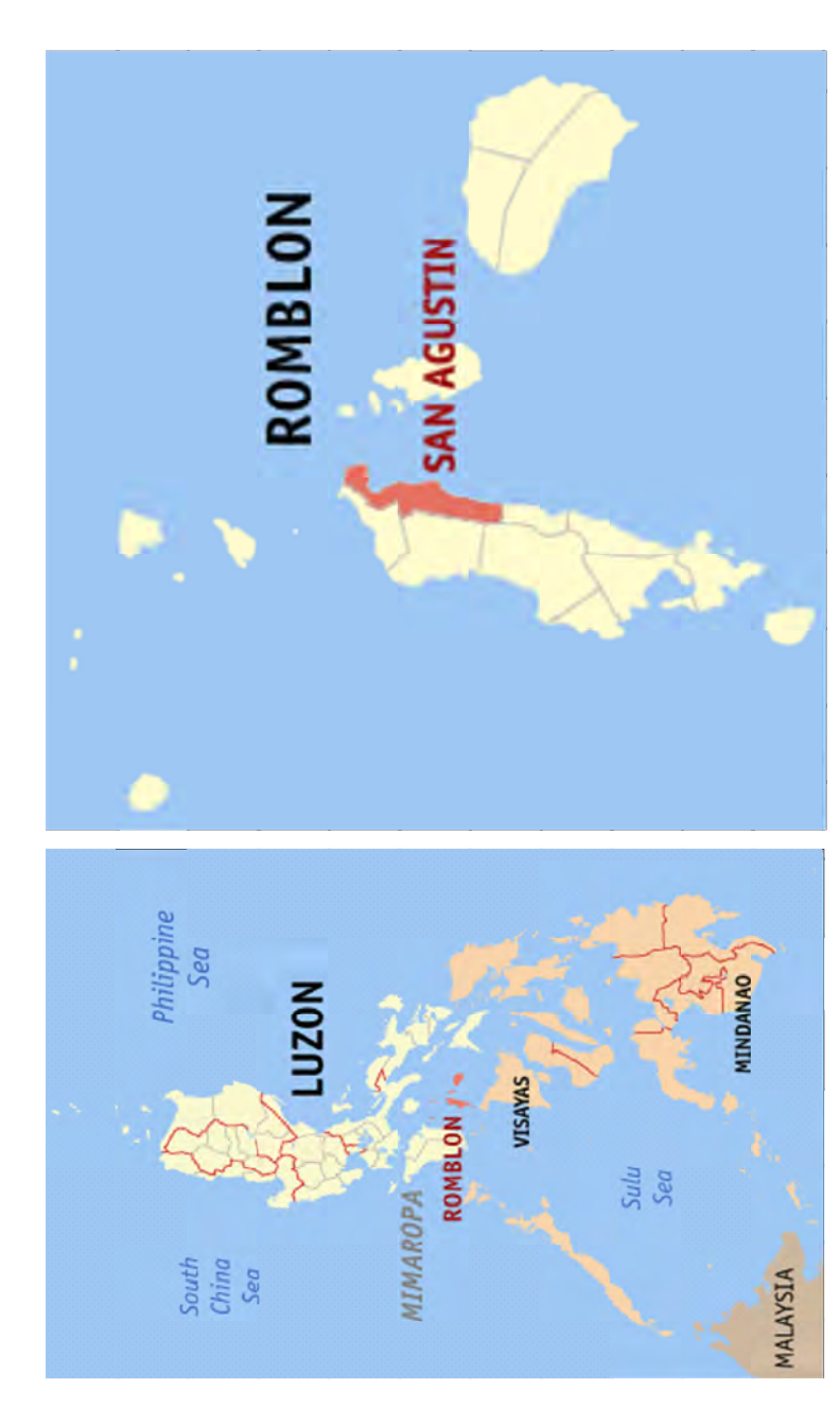
Figure 1. Map of the Philippines and of Romblon. Source: Wikipedia maps by Eugene Alvin Villar (Philippines) and Mike Gonzalez (Romblon).