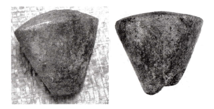
Figure 2 Spindle whorls from Fengpitou, Taiwan (left) and Callao, Philippines, width of 4 cm (right)