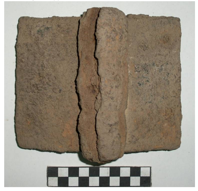
Figure 9a: A corroded metal butterfly hinge.