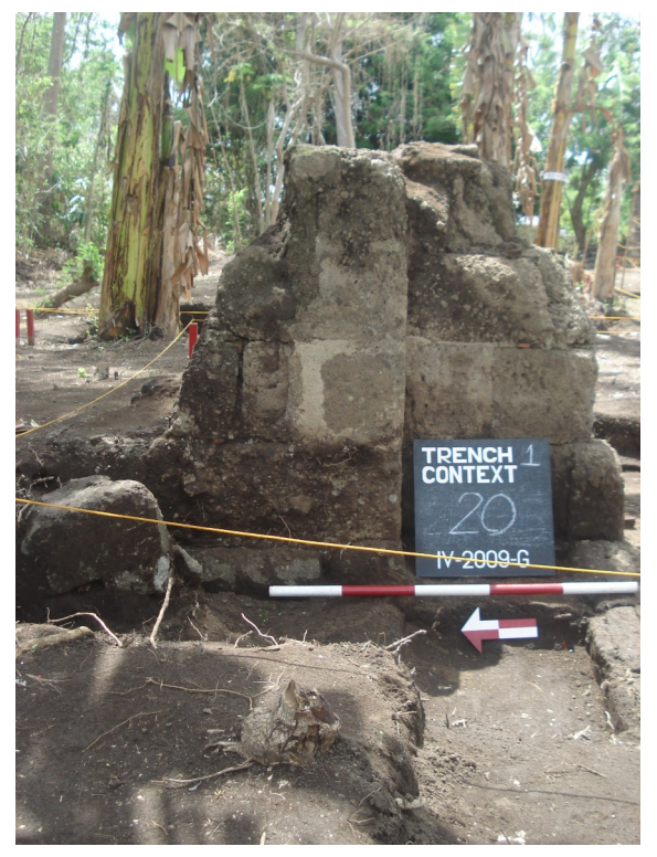
Figure 8a: West view of the northwest corner.