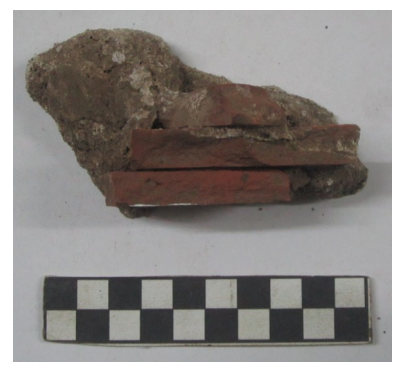
Figure 5c: Earthenware sherd with evidence of being used as an aggregate.