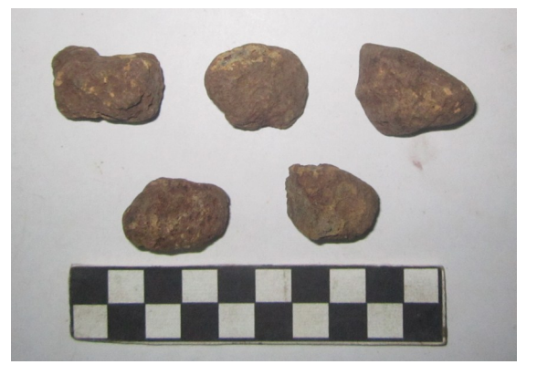
Figure 5b: Scoria collected from Structure B.