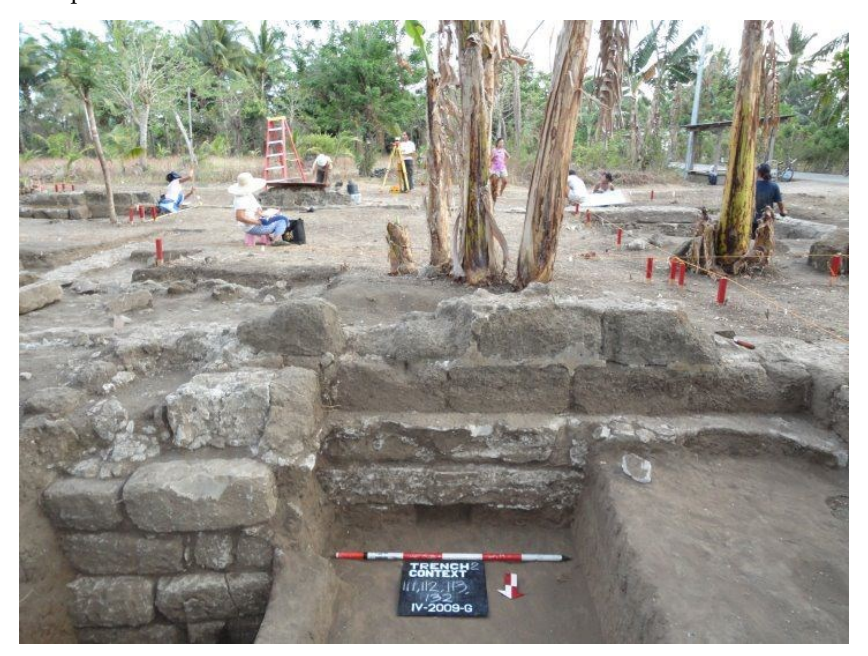
Figure 11: A portion of the north wall showing a post hole and post base and its foundation which used dry masonry; the only single wall in Structure B constructed through solid masonry.

Figure 10: This is the eastern half of Structure B where remains (i.e. grout filling) of interior stone pillars and double walls are found.