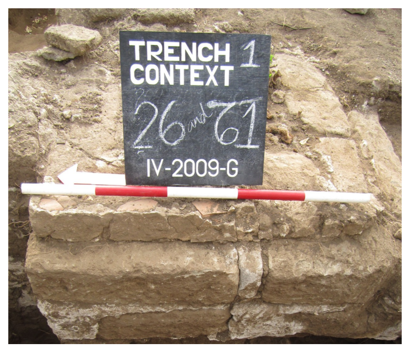
Figure 2: A pillar base made of tuff stone blocks bound by lime mortar and exhibiting evidence of lime mortar finishing for what used to be a pillar in the southwest corner of Structure B.