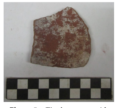
Figure 5a: Tisa fragments with evidence of being used as aggregates.

Figure 4: Roof tile fragments used as aggregates for a pillar grout.