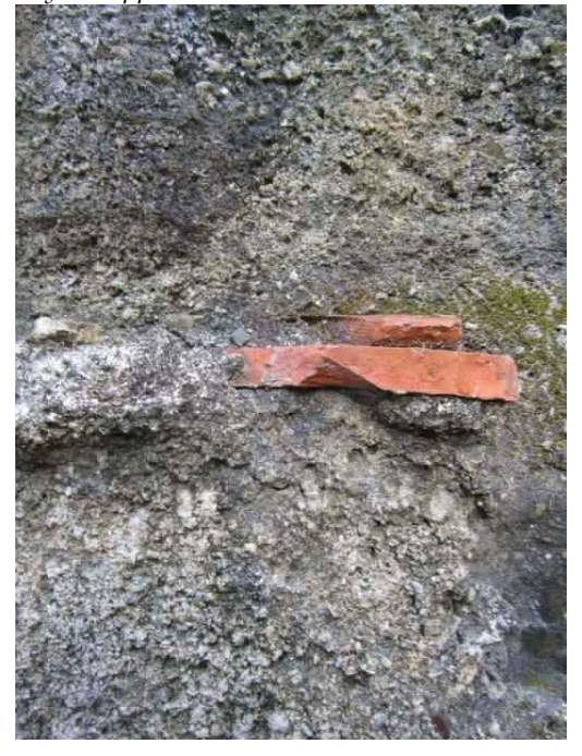
Figure 4: Roof tile fragments used as aggregates for a pillar grout. (Photo by K. Tantuico).