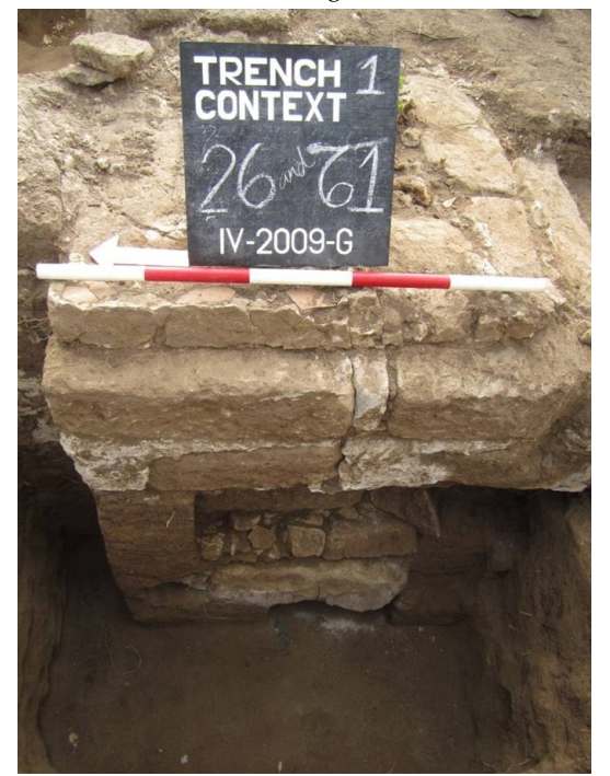
Figure 14: Ruins of a pillar, its base, and its foundation located in the structure's Southwest corner in Trench 1.