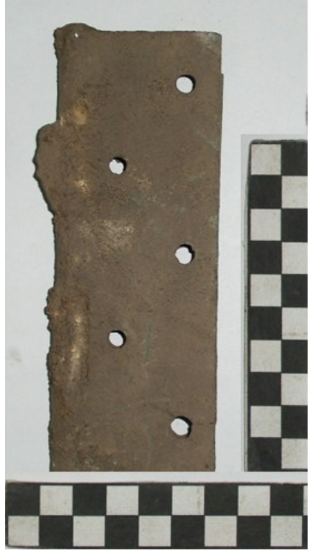
Figure 9b: Half of a metal hinge.