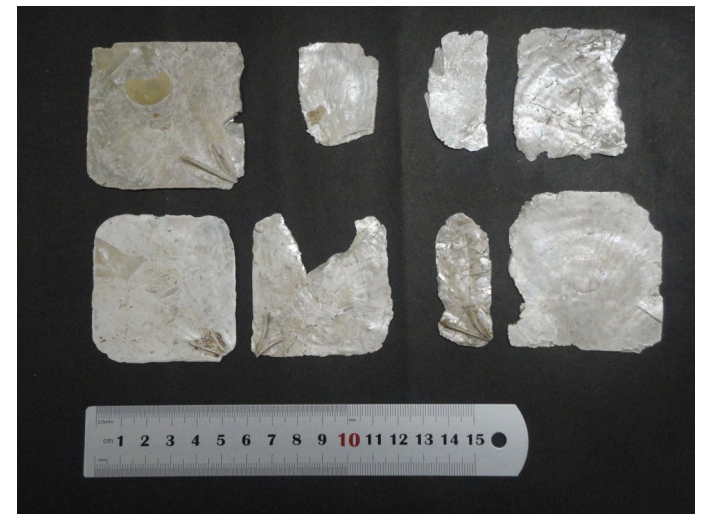
Figure 6: Capiz shells used in windows.

Tuff and conglomerate stone blocks, lime mortar, and cement along with various aggregates comprised the structure's foundations, walls, and pillars. Along with these masonry materials, though, locals accounted for wooden posts which they identified as mulawin or commonly known as molave ( Vitex parviflora ). These wooden posts were supposedly taken during the destruction of the structure, explaining why the only archaeological evidence found were post holes, post bases, and their foundations. There were six post holes unearthed and one more that could have possibly been a post hole but was no longer explored. These, however, accounted only for the structure's ground floor. According to interviews with local residents, the structure had a second floor made of thick wooden slabs or tabla . These, too, were supposedly made of hardwood. Furthermore, according to one account, the second floor was wrapped in capiz windows. Consistent with archaeological evidence, worked capiz shells were retrieved from the site (Figure 6).