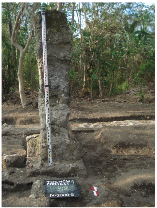
Figure 3: Lime mortar fill of a pillar within the eastern half of Structure B.

Figure 2: A pillar base made of tuff stone blocks bound by lime mortar and exhibiting evidence of lime mortar finishing for what used to be a pillar in the southwest corner of Structure B.