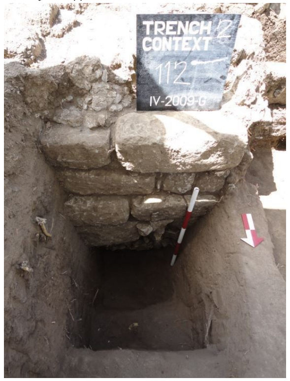
Figure 13: A post base foundation found along the structure's North wall in Trench 2.