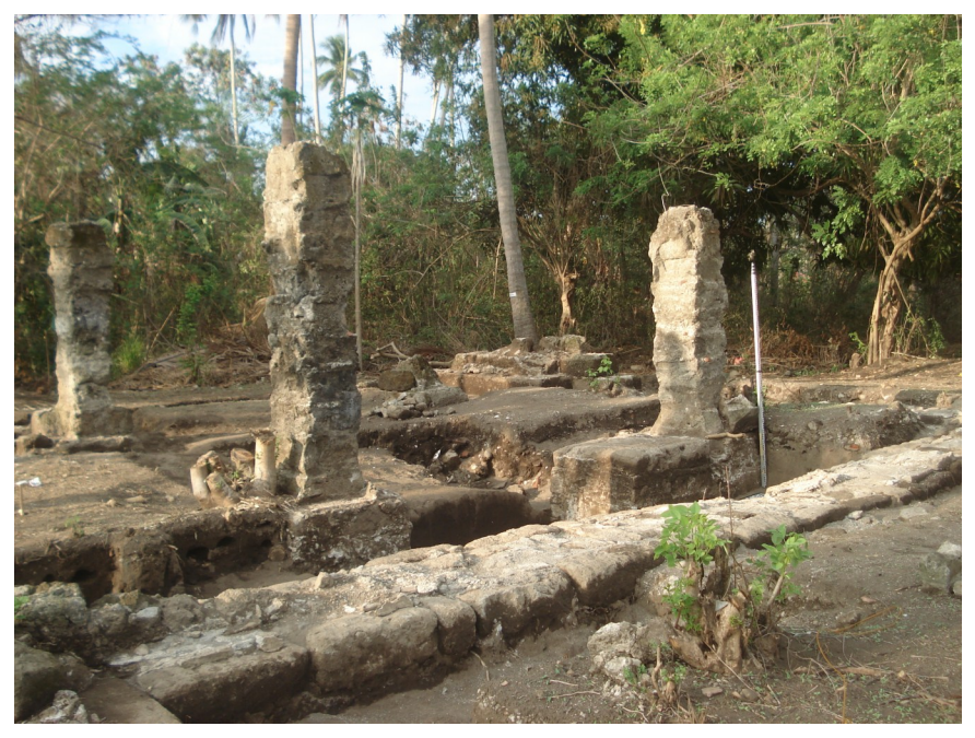
Figure 10: This is the eastern half of Structure B where remains (i.e. grout filling) of interior stone pillars and double walls are found.

were oriented north-south while those on the west had an east-west orientation (Figure 15).