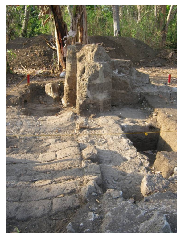
Figure 8b: South view of the northwest corner with attached pavers.

Figure 8a: West view of the northwest corner.