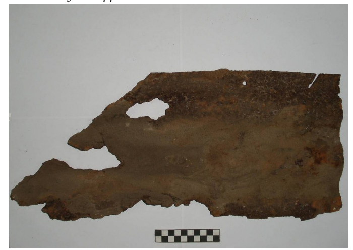
Figure 7: Corrugated galvanised iron sheet fragment.

The south face of the northwest corner had a smooth finishing suggesting that it was the end of the feature and not a result of the structure's destruction. There was also a mortar bed with stone block impressions connecting the northwest corner to the west wall, and leading up to this area from the west are stone block pavers (Figures 8a and 8b). According to local accounts, the entryway was big enough to fit a horse carriage. The distance between the south face of the northwest corner to the edge of the west wall was approximately 165 cm, a reasonable width which may have been wide enough for a horse carriage. Another entryway was directly across the west entryway to the east also with pavers leading up to it. This was smaller though, with a width of 140 cm, and had evidence of being closed off. The door to the main entryway was said to have been made of hardwood. Again, no evidence of this wooden door was found except for metal hinges that are decidedly thicker and bigger than those currently used in houses (Figures 9a and 9b).