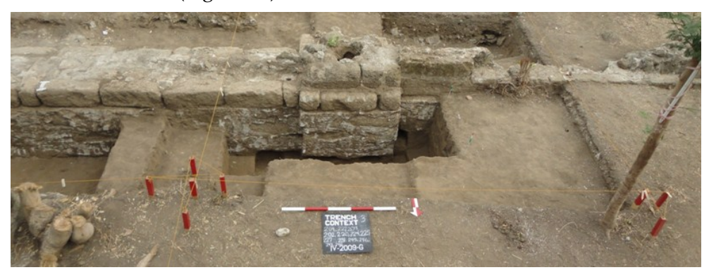
Figure 12: A portion of the structure's south wall found in Trench 3 exhibiting pronounced differences in wall construction.

Structure B had noticeable inconsistencies in its construction. Just along the south wall found in Trench 3, the double wall east of the exposed post base was 93 cm wide while the double wall directly west of it was only 55 cm (Figure 12). Further to the west closer to the southwest corner of the structure, the wall once again thickens to 62 cm at its widest. Such a drastic change in wall width was also observable along the north walls in Trench 2 (Figure 15).