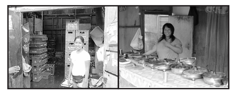
Figures 4 and 5. Female owners of a soda and beer warehouse and a home-cooked meals business in Labrador proudly pose in front of their enterprises.

services than conventional clinics ("Minda"). The same can be observed in Mehan's eight internet cafes, whose legal internet connections and computer operations without city business permits allow its owners to offer hourly use rates that are half of those in duly-registered shops. A businessman even took advantage of the proximity of Mehan to government institutions such as the National Power Corporation, Philippine Children's Medical Center and the Bureau of Internal Revenue to set up a thriving laundry business within the perimeter space of the site straddling a main road: "Galing sa iba-ibang lugar ang mga kliyente ko. Yung iba taga-dito pero may mga kostumer din akong empleyado sa BIR at Napocor at pati mga kamag-anak ng mga pasiyente na naka-confine sa Children's Medical." ("My customers come from different places. Some are from the community, but I also have clients from BIR, Napocor and even from relatives of patients staying at Children's Medical.") ("Winston", personal communication, September 2, 2010)